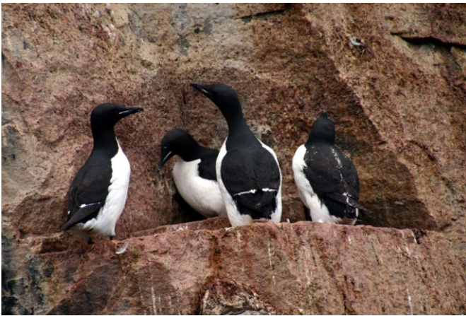
Common guillemots ( Uria aalge ) on Bird Mountain in Svalbard, Norway.

It is difficult to predict what will happen to birds. The main reason for this is that few birds stay in the Arctic for longer than three months per year. Their living conditions depend on what happens elsewhere. However, it is likely that the climatic changes underway in the Arctic will not exceed the adjustment capacity of the birds that nest there. Earlier snow-melting and increased summer temperatures will be beneficial for successful nesting.