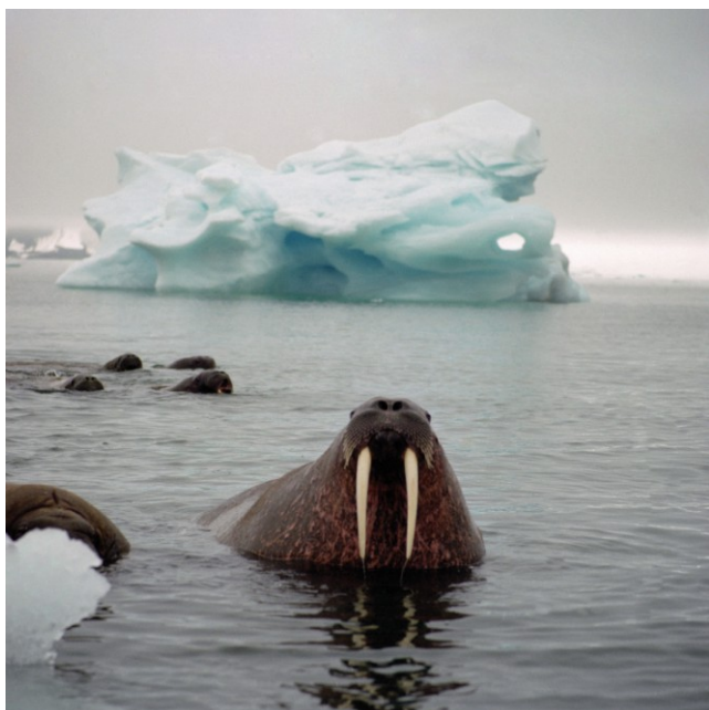
Walrus ( Odobenus rosmarus ), Svalbard, Norway.

Attempts during recent years to chart environmental toxins have revealed high levels of toxicity in arctic sea mammals. These toxins are stored in the fatty tissue and are transferred from small animal plankton to fish and then onwards to sea mammals and sea birds. Environmental toxins affect the reproductive abilities of animals. Recent research shows that climate change can potentially alter the transport of pollution to polar areas and exert an even greater burden in the form of environmental toxins on the arctic ecosystem. As climate change warms arctic waters, higher temperatures can increase the uptake of toxins in marine organisms.