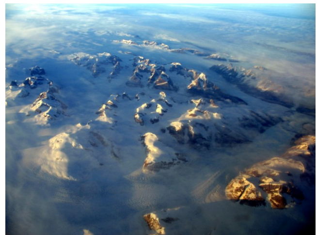
Inland ice and glacier arms protruding into the sea

Arctic ecosystems are highly restricted by low temperatures and permafrost. Huge quantities of carbon have accumulated in the soil in the form of frozen or buried organic deposits. Scientists believe that these layers of organic materials are a potential source of major emissions of the greenhouse gases carbon dioxide (CO 2 ) and methane (CH 4 ). If the permafrost melts, these organic materials will break down more rapidly and there will be dramatic increases in emissions of carbon dioxide and methane. This is one example of a so-called “positive feedback effect” where a warmer climate leads to increased emissions of greenhouse gases, further reinforcing the greenhouse effect. Arctic warming has already resulted in an increase in net emissions of carbon dioxide and methane and is contributing to increasing atmospheric concentrations of carbon.