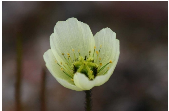
Svalbard poppy ( Papaver dahlianum )

Insect pollination is one of the results of evolution and long-term coexistence between insects and plants. Some of these symbiotic relationships are very strong and thus particularly vulnerable to climate change. For example, a warmer climate could result in earlier flowering, without the life cycle of the insects on which the plants are dependent undergoing a similar shift.