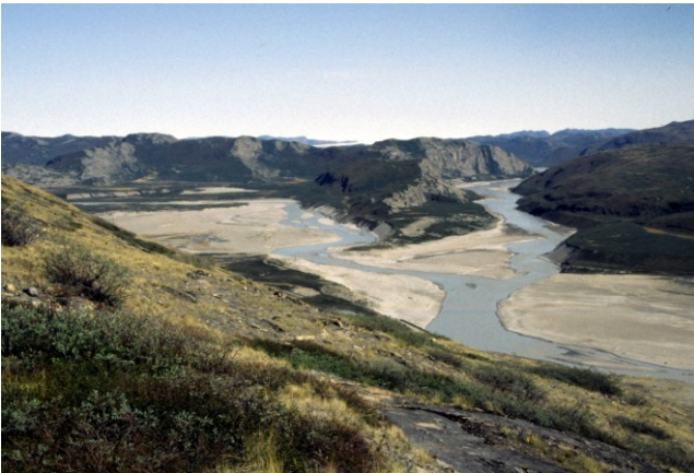
Arctic landscape and glacier rivers

The dominant plant species that constitute arctic vegetation are very different from most other types of vegetation (apart from alpine vegetation) because these species are able to carry out their metabolic and reproductive processes just above or below 0°C. Permafrost levels in the Arctic have existed for thousands of years, covered by just a thin, active layer of soil that thaws every summer. Access to nutrients is limited due to the low temperatures and the thin layer of soil. Arctic plant species have adapted their access to nutrients and their growth to this thin but relatively constant soil. Climate change can alter several of the environmental factors to which arctic plant species have become adapted. An extended growth season, earlier snow-melting, altered precipitation patterns, deeper layers of soil and increased mineralisation and decomposition rates will all affect the productivity responses and phenological development of these plants.